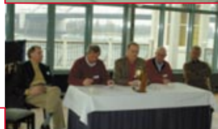
South-West-fleet members, 'Zalmhuis' Rotterdam.