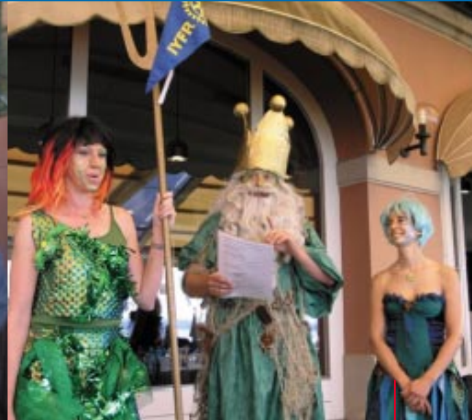
Neptune and his mairmaids wish good luck