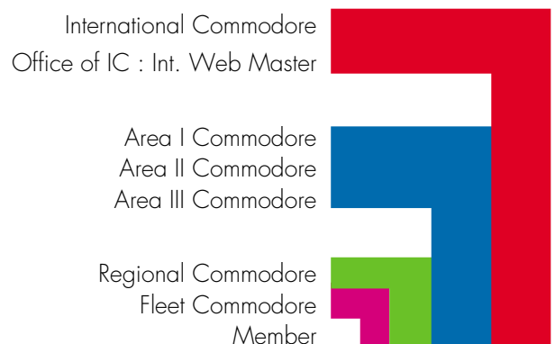
Fig.1 Access levels at hierarchic order.

Web Master. This level also can make every alteration and/or amendments on the data and web site (see fig. 1). All members can access the data at every level in this logic, but editing, deleting, changing and/or removing of a data can be made only through the following access hierarchy.